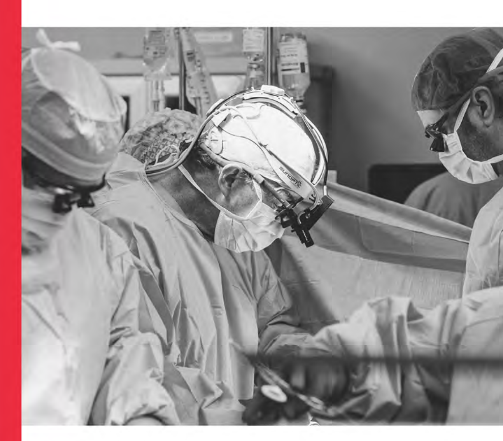
Hamilton Cardiovascular Institute